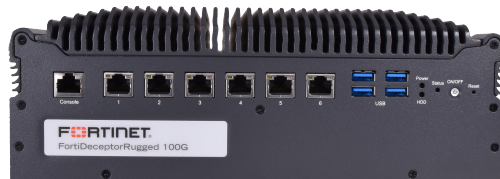
FortiDeceptor Rugged 100G

* Operating at maximum temperature derates 1.5°C per 1000 ft (305 m)